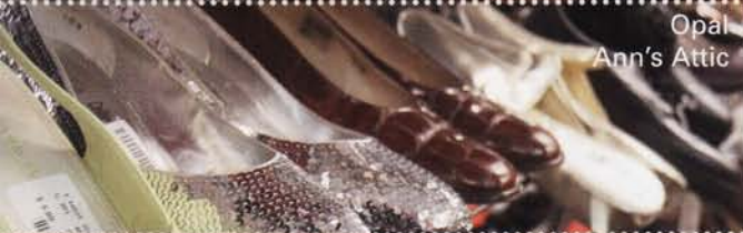
Opal Ann's Attic

• Goodwill Industries, 228 Bullsboro Dr., Newnan. A favorite among savvy shoppers. Dropping off donations is easy and gives you an excellent reason to browse the store. Goodwill provides ample parking, excellent lighting and dressing rooms. Although the clothes are slightly more expensive than the Salvation Army's, the shoes are cheaper, and the linens are easier to inspect since they're on hangers. Be on the lookout for new items donated by Target, usually seasonal merchandise. My recent great finds include a pink button down polo shirt, a Sock Hop outfit, and an adorable chef statue for the kitchen.