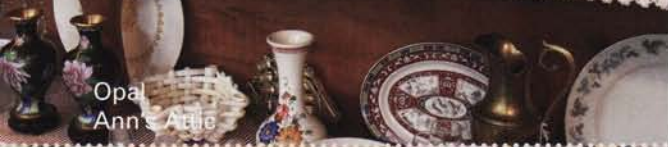
Opal Ann's Attic

• New Beginnings, sponsored by the Community Welcome House. It takes a keen eye to spot this neat thrift store located off Jefferson Street (just past downtown Newnan's DQ). This store contains everything from A-Z including cute clothes for kids, books and household goods. All sales benefit the Community Welcome House. Be sure to note the hours, Thurs-Fri., 10 a.m.-2 p.m. and Sat. 10 a.m.-4 p.m.