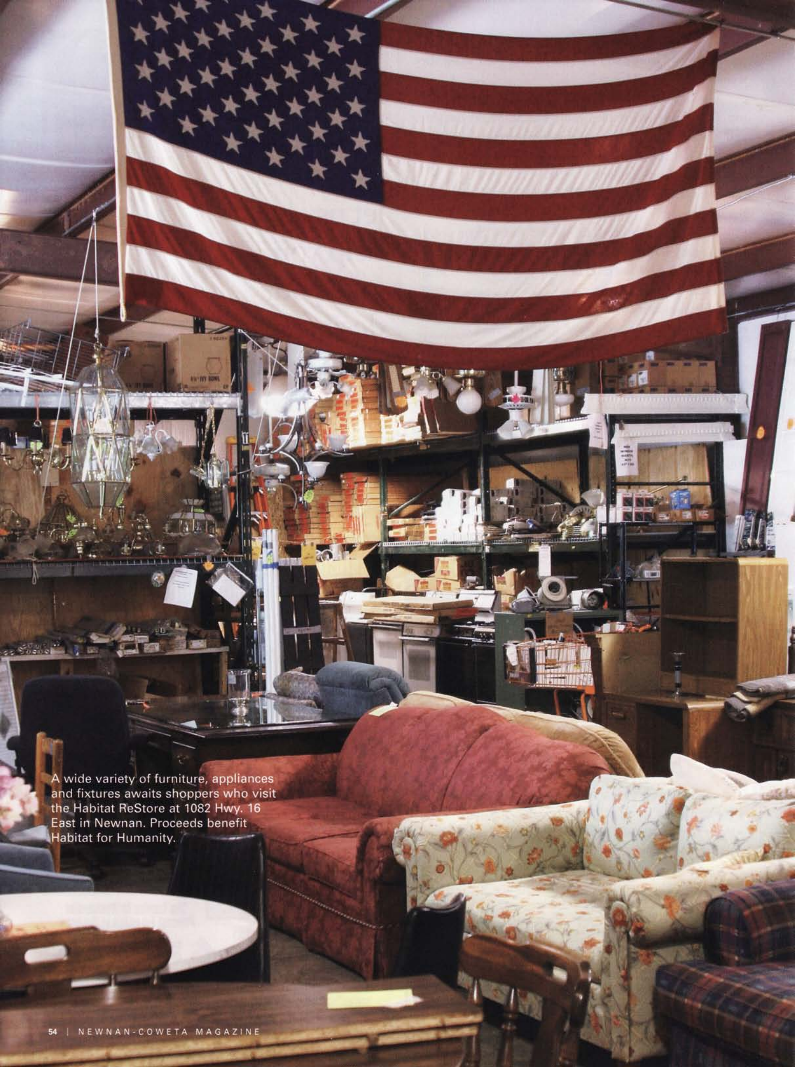
A wide variety of furniture, appliances and fixtures awaits shoppers who visit the Habitat ReStore at 1082 Hwy. 16 East in Newnan. Proceeds benefit Habitat for Humanity.