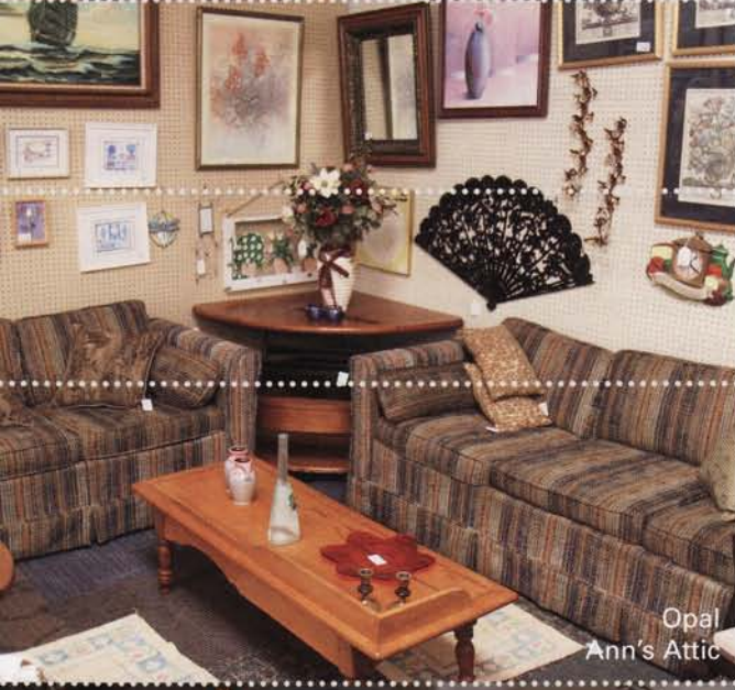
Opal Ann's Attic

• Opal Ann's Attic, 36 Salbide Ave., Newnan. Remember the joy of rummaging through your Grandma's attic when you were a child? From antiques to clothing, you are sure to find something you have to have but never knew you needed.