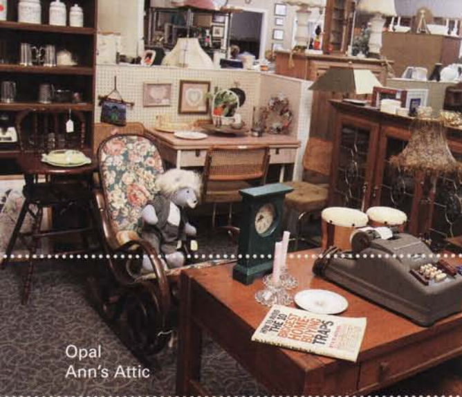
Opal Ann's Attic

• Goodwill Industries, 228 Bullsboro Dr., Newnan. A favorite among savvy shoppers. Dropping off donations is easy and gives you an excellent reason to browse the store. Goodwill provides ample parking, excellent lighting and dressing rooms. Although the clothes are slightly more expensive than the Salvation Army's, the shoes are cheaper, and the linens are easier to inspect since they're on hangers. Be on the lookout for new items donated by Target, usually seasonal merchandise. My recent great finds include a pink button down polo shirt, a Sock Hop outfit, and an adorable chef statue for the kitchen.