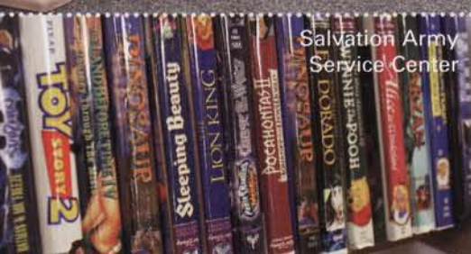
Salvation Army Service Center